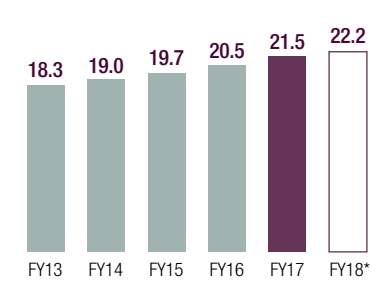
Distributions (¢) per stapled security

Management continues to evaluate the existing portfolio for further opportunities where higher underlying values can be realised.